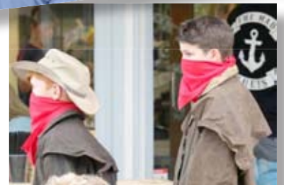
The Mansfield boys and James AB escaping with the spoils of the hold up