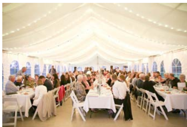
This is the eighth year Poachers Pantry has hosted fund raising events for our local community.

Poachers donated $6000 from ticket sales as well as a box of Wily Trout wine and a voucher to the Smoke House Café.