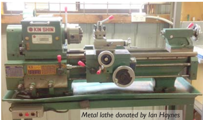
Metal lathe donated by Ian Haynes

There are already a couple of jobs lined up for the blokes who have previous lathe experience, so it can be put to immediate use. They're also keen to teach others willing to learn how to use it.