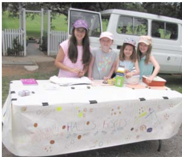
▲ Simpson children selling home-made biscuits in Victoria St