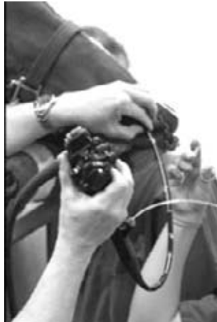
Scoping a horse

No, scoping a horse is not a painful procedure. Once the scope has been passed into the nose, it is usual for the horse to find this action mildly uncomfortable, likely more of a 'ticklish' feeling. The endoscope is about 1cm in diameter and the horse can not feel it inside their stomach. However, whilst the procedure is painless, being surrounded by many people and strange equipment can be a little stressful for a horse and therefore sedation is usually used to combat this.