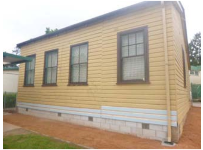
New downpipe, drain, foundations, blocks, and weatherboards on the old school building

I wish all the Museum volunteers, 'Friends of the Museum', supporters and visitors a very merry and safe Christmas and a happy new year.