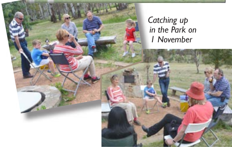
Catching up in the Park on 1 November

We had a great time at the Party at the Hall shops showing our wines and catching up with friends old and new. Loved all the country activities that make Hall special.